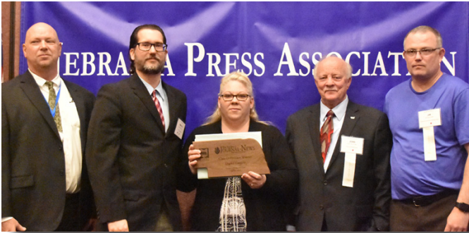
Digital Class D - 1st Place Fairbury Journal-News

Fifth-generation Edgecombe family to sponsor permanent, traveling digital sweepstakes trophies & digital class awards