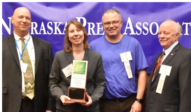
Digital Weekly Sweepstakes Orchard Antelope Co. News

(not pictured) Digital Daily Sweepstakes Kearney Hub