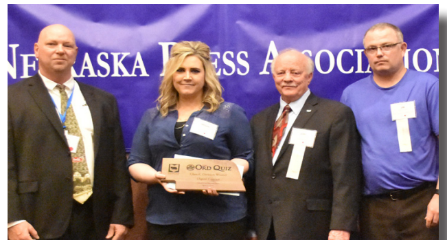
Digital Class C - 1st Place (TIE) Ord Quiz