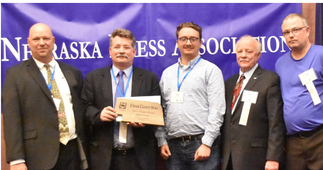
Digital Class C - 1st Place (TIE) Hartington Cedar Co. News