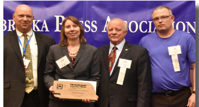
Digital Class B - 1st Place Orchard Antelope Co. News