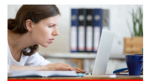
People search for specific information on the internet and tend to ignore what they aren't looking for

Two recent examples highlight the danger of publishing notice only on government websites.