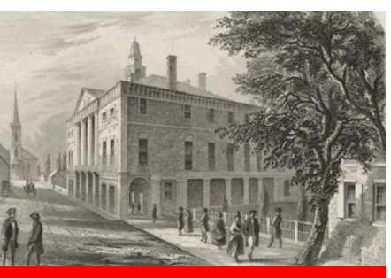
Federal Hall in New York City, site of the first two sessions of the U.S. Congress

The concept of public notice was conceived long before the emergence of newspapers, when early civilizations posted notices in public squares. This crude method was eventually refined with the publication of the first English language newspaper in 1665—a court newspaper called the Oxford Gazette. After it was renamed The London Gazette, the paper began carrying notices from the King's Court and from public officials in London and outlying regions<sup>2</sup>.