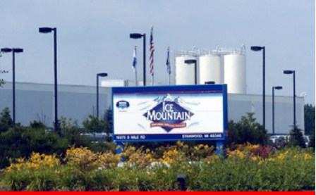
Nobody knew about Nestle's proposal to pump more groundwater because the only notice was posted on a government website

We behave differently on the internet. We tend to be goaloriented, visiting websites for a particular reason. Although digital interfaces at their best encourage serendipity, it tends to be unidirectional<sup>20</sup> and is often focused on the sensational<sup>21</sup>. Public notices don't stand a chance in that environment; they get lost and are easily hidden. Moreover, the massive migration from desktop computers to small-screen mobile devices has exacerbated the problem.