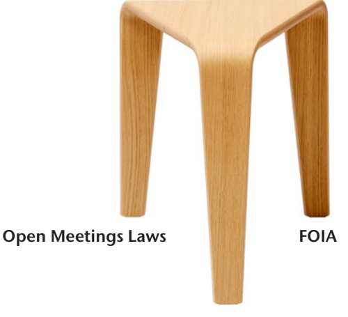
Public Notice Laws