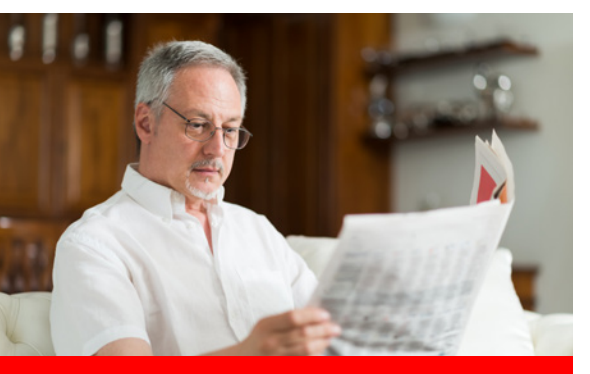
Reading a newspaper, people discover things they didn't expect to see

It's hardly surprising that far more people read the print and electronic versions of newspapers than visit government websites. Newspapers' business model demands readers; without enough of them their very existence is threatened. So they're published on a daily or weekly basis, and most newspaper websites are updated continuously. They include a wide range of news and information produced