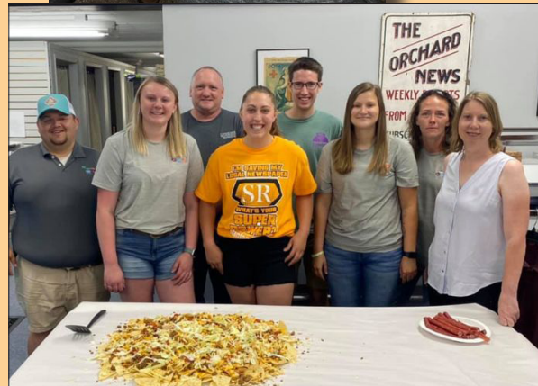
Staff enjoyed 'Watch Party Nachos' at the Orchard/Neligh Antelope Co. News.

Thank you for sharing your 'watch party' photos!