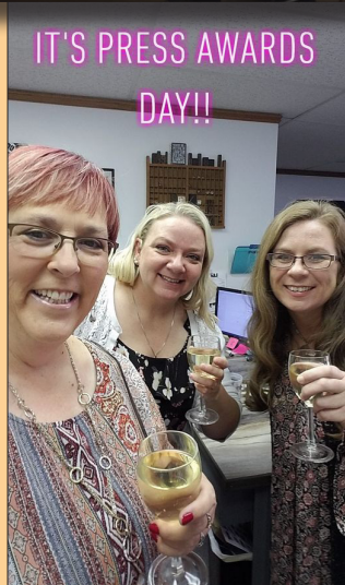
Wine was flowing at the Gothenburg Leader's watch party.