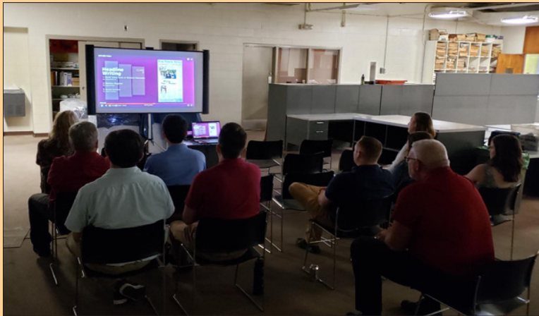
All eyes were glued to the screen at the Norfolk Daily News watch party.