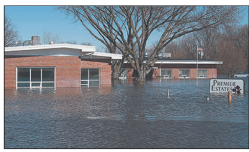
DAILY NEWS ARCHIVES

As another example, at least one tornado ravaged the community of Pilger in June 2014, causing damage, injury, unrest and chaos. The Daily News published articles regarding the tornado damage and stories