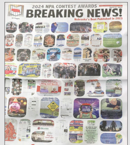
Congratulations to all NPA Better Newspaper Contest & Special Award winners!